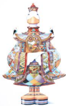
Image: Gordon Fitchett, The Little Prince , 2009, Colour pencil on Arches paper, 73 x 91 cm.

An exhibition of works particularly for children but also suitable for adults in need of a little nostalgia in the lead up to Christmas. From original book illustrations to contemporary colourful sculptures and hand-made wooden toys by local Goulburn Woodworkers, there's something to delight everybody in the toybox.