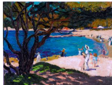
Image: Ethel CARRICK FOX (1872 – 1952) On Balmoral Beach, Sydney, 1913 Oil on canvas on board 26 x 34cm